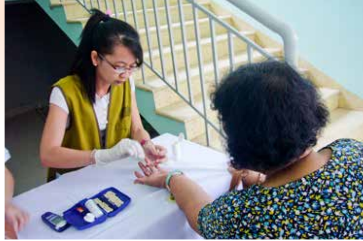
Besides seeing a doctor, this free clinic also provided health exam service such as blood sugar test, ultrasonic exam, EKG.

This time they only have half day for free clinic day. With everyone working together, we were able to treat nearly five hundred people within four hours. Besides pediatric and dental services, we also provided preventive medical treatments, such as blood sugar testing, sonograms, and ECG. As usual, the doctors were friendly and careful during the treatment and the volunteers offered tea and treats while people waited. This has become a standard of Tzu Chi's free clinic day. Volunteers said that each time, they experience a different feeling; but seeing people smiling, they are touched and full of joyfulness.