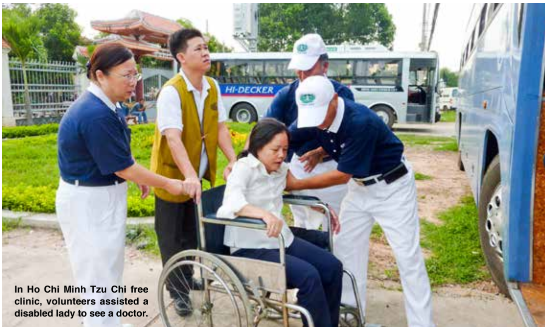
In Ho Chi Minh Tzu Chi free clinic, volunteers assisted a disabled lady to see a doctor.

Sunday, April 8 was the first free clinic day. The location is the "home of heroes - Cu Chi County." After one-and-a-half-hour drive, four big buses brought nearly two hundred volunteers and medical staffs to help nearly five hundred people of An Fu District and An Ren District within the county.