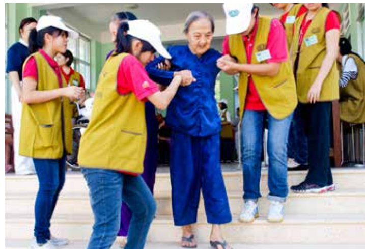
A high school student at Ho Chi Minh City Taiwan school spent time to be a volunteer in this free clinic.