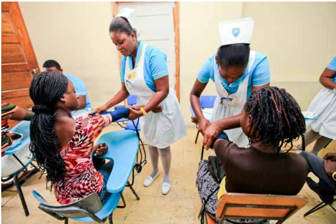
At the premier of a major free clinic in Haiti, thirty local nursing students came to join and assisted patients with vital sign measurement and the documentation of height and weight.

Outside the clinic, the chairs were been aligned while all the equipment was